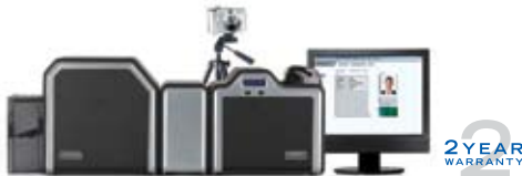
HDP5000 printer/encoder shown with optional two-sided printing and lamination modules.